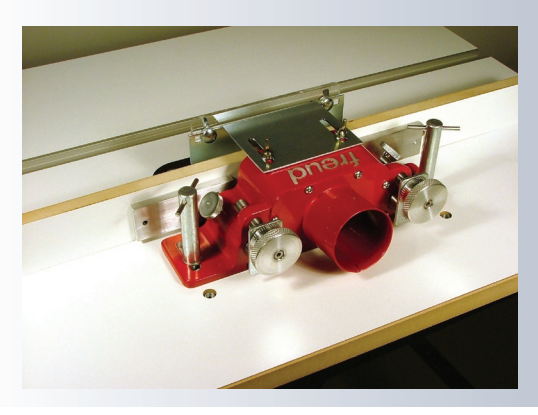
left Independently adjustable fence faces make this a versatile tool

right The assembled router table ready to go