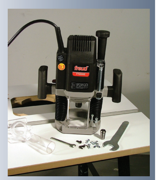
above Also included is the powerful FT2000E router