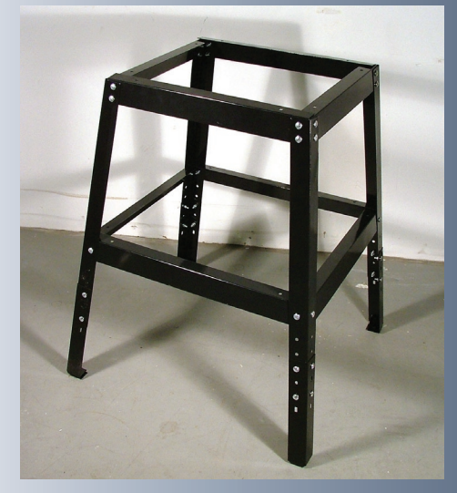
above Take care to identify all the parts, then assemble the base