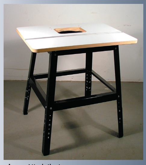
above Attach the top

it walking around in use or tipping if long heavy workpieces are being routed. To attach to the top of the base there is a sturdy and flat router tabletop, which is 32" x 24" x 1" thick, melamine-faced MDF and incorporates an aluminum channel for your miter fixtures, as well as the threaded mounting points for the fence. Also pre-machined is the cutout and recess required to fit the nicely made insert plate. The plate is supplied with a pair of clear plastic reducing rings so you can close the gap when using smaller router bits, this helps to stop your work dipping into the gap. There is also a lead-in pin for freehand work with patterns.