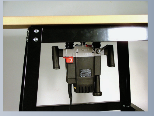
above With the router in place it's controls are easy to reach