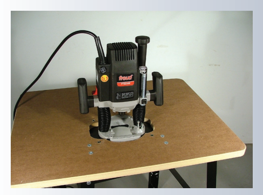
above It is easier to flip the top to attach the router